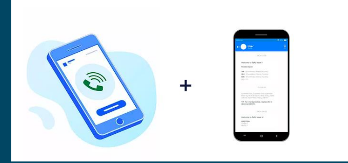
In Botswana, Young 10ve developed a phone-based intervention to keep children learning. The programme reduced innumeracy by 31%, generating global interest. Replication trials of this intervention were conducted in Kenya, India, Nepal, Uganda, and the Philippines.