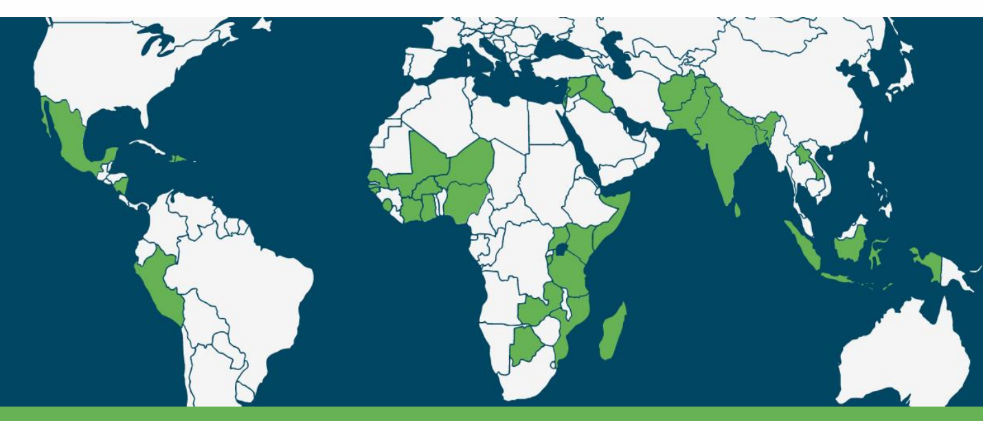
Countries where citizen-led assessment tools have been used

The People's Action for Learning (PAL) Network is a south-south partnership of 15 member organizations working across South Asia, Africa and Latin America. Member organizations conduct Citizen-led Assessments (CLAs) and/or actions aimed at improving learning outcomes.