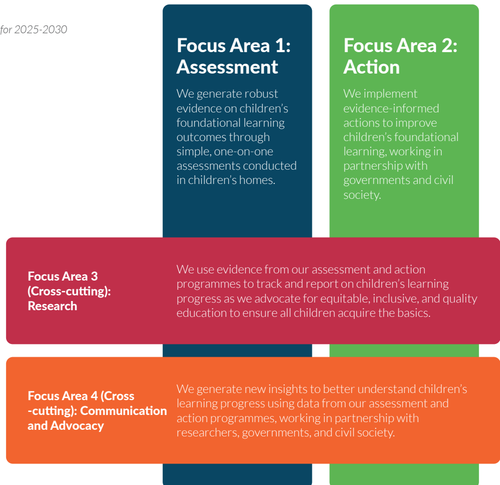
Figure1: PAL Network Focus Areas for 2025-2030 strategic plan

With millions of children in the Global South out of school and many in school not learning, PAL Network is committed to accelerating efforts to ensure all children build a strong foundation for lifelong learning.