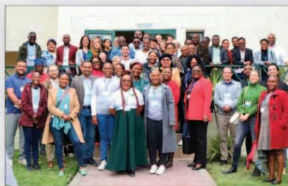
Partners Summit in Maun, Botswana - June 2024

In March 2024, Youth Impact celebrated its 10th anniversary. Over the past decade, 250,000 young people have been served by three programs, 1 million people impacted across 25 countries, 2 million lessons delivered in 32 languages, 53 rapid, rigorous, randomized trials conducted, and over 100 partnerships launched. In addition to measuring their impact so far, Youth Impact joined forces with partners to look forward and plan for their second decade of global evidence-based expansion. They hosted a high-level learning summit in June 2024 in Botswana, where they had productive dialogues with senior partners from four national governments, academia, International and National Non-Governmental Organizations. Youth Impact strengthened their relationships ready for significant scaling expected in 2025, particularly in the Philippines, Namibia and South Africa.